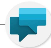
Power Virtual Agents Intelligent virtual agents