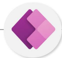
Power Apps Application development