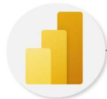
Power BI Business analytics

Innovation anywhere. Unlocks value everywhere.