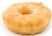
Minimum Viable Product

“First create a minimum viable product - something that communicates the core ideas but uses the fewest possible resources possible”